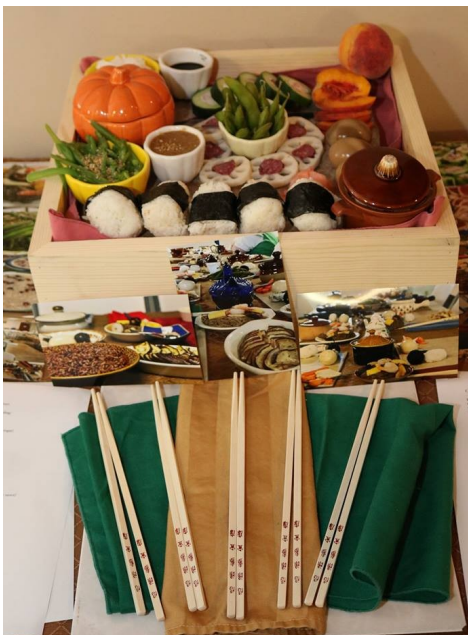
A variety of Japanese delicacies presented by Baroness Katryne MacIntosh the Strange.

Other entries included a beautifully presented box of Japanese foods from the pre-Edo period, wood blocks for printing fabric, a Tudor dress, scrolls, two pigment entries, and hand-spun wool. In the "Display Only" area was some of Master Addison's lovely portrait work, as well as a windlass for winding fabric during the dye process, built by Lord Eldred Ulfsson.